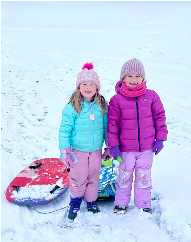
Having a fun time at the Greenside Grill at Winterfest!