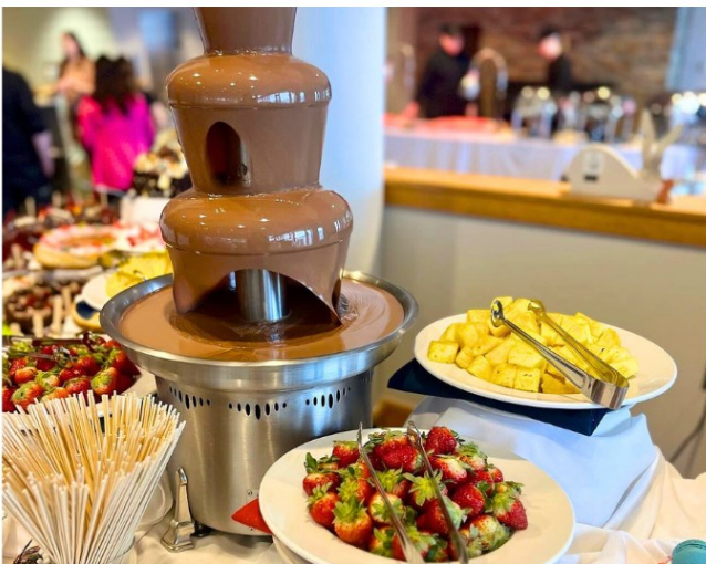
Pictures from our Easter Brunch dessert table creatively put together by our culinary team!